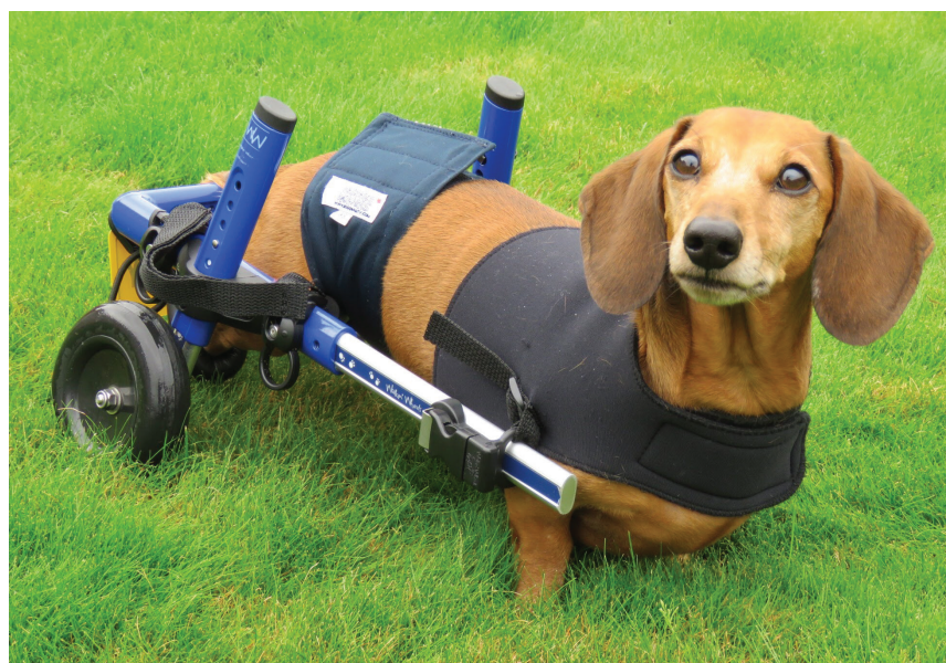
Fig 5: A non-ambulatory dachshund using a cart