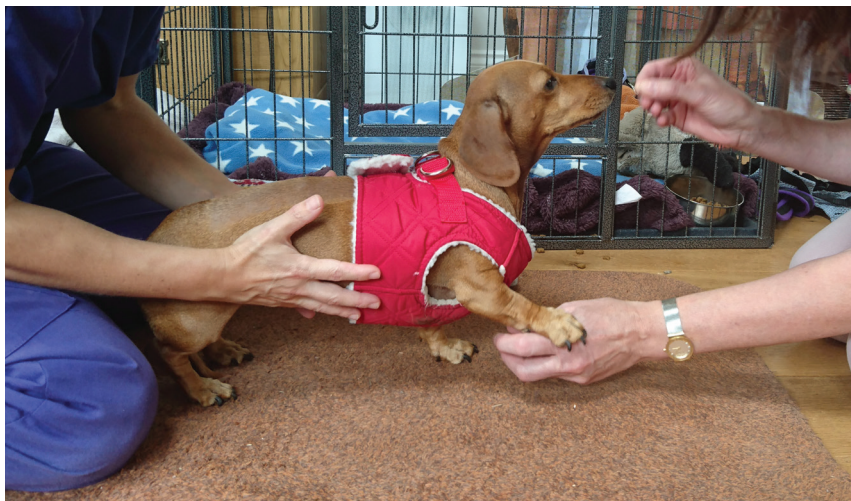
Fig 7: 'Supported standing' is a functional exercise that improves proprioception and strength and is therefore good preparation for learning to walk. For this patient at three weeks after spinal surgery, supported standing was combined with lifting each front paw. This not only added to the challenge but was a trick that she'd always enjoyed

If deep pain sensation is absent, then surgical outcome is uncertain, with only 50 to 60 per cent of dogs regaining ambulation (Scott and McKee 1999, Ito and others 2005,