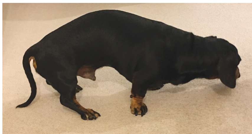
Fig 2: Characteristic kyphotic standing posture of the ambulatory dachshund with thoracolumbar intervertebral disc herniation

FL Front limb (thoracic limb), HL Hind limb (pelvic limb), LMN Lower motor neuron, UMN Upper motor neuron