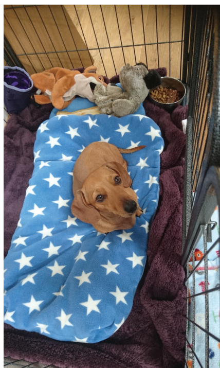
Fig a: A miniature dachshund in a recovery pen

For the safe area to be accepted by the dog, it should be introduced gradually if possible. Set it up comfortably with bedding, food and water before first showing it to the patient. Food-dispensing toys can help to alleviate boredom. Further detailed home care advice for owners is available at http://therehabvet.com/recovering-dogs-advice-for-owners/