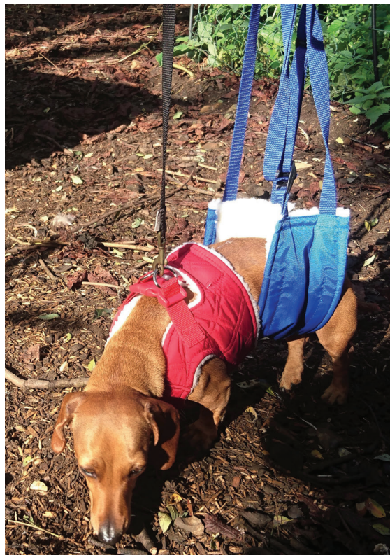
Fig 6: Outdoor time during recovery from decompressive thoracolumbar spinal surgery. The hindquarter sling supports the rear end. The lead and chest harness prevent the patient from rushing forward, giving it a chance to stand and step with its paretic hindlimbs

Following spinal surgery, and clinical signs may recur due to subsequent extrusion of another disc(s).