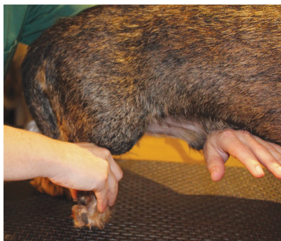
Fig 3: Performing the proprioceptive knuckling test. Lift the paw and place it on its dorsal surface – a normal dog will briskly replace the paw with pads down; failure to replace a knuckled paw within two seconds indicates poor proprioception. Note the supportive hand placed under the dog's abdomen

prognosis [Ito and others 2005, Aikawa and others 2012]. However, nociception should only be tested in severely affected dogs. If a limb still has conscious movement then deep pain sensation should be present, and pain testing would cause unnecessary distress.